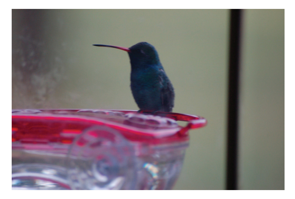
Figure 2. Male Broad-billed Hummingbird ( Cynanthus latirostris ) perched on a window feeder at 322 Tan Tara Street, Stillwater, Payne County, Oklahoma, 13 October 2014.

R., and J. A. Grzybowski. 2011. Spring migration: March through May 2011: Southern Great Plains. North American Birds 65:475–478 [photo on page 570]).