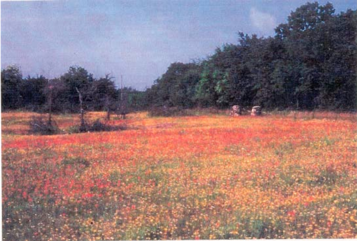
Entrance to Pontatoc Ridge Preserve