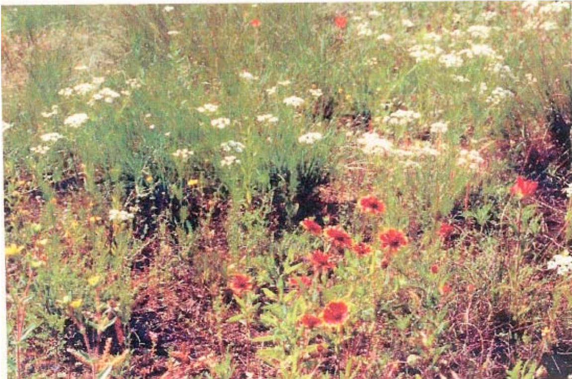
Wildflower community on exposed limestone formation at Pontatoc Ridge Preserve