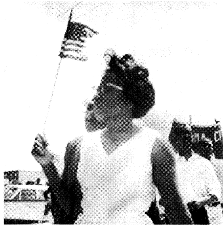
Oklahoma City NAACP Youth Director Clara Luper leads a group of demonstrators in Lawton on June 11, 1966 to protest a segregation policy barring Blacks from the swimming pool at privately-owned Doe-Dee Park.

Luper decided to take the students to New York by the ‘northern route’ and return by the ‘southern route.’ In St Louis they experienced an integrated