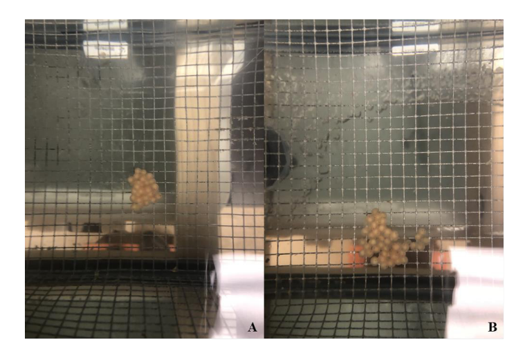
Figure 4. Image (A) shows a clumped egg mass indicative of control tanks with a water hardness of 87 mg/L and image (B) illustrates the observed breakdown of the egg mass spawning matrix in the treatment tanks with water hardness ≥500 mg/L.

significantly higher overall mortality than fish A (mean = 0.20); however, both mortality rates were similar to Fish C (mean = 0.28; Figure 5). Shapiro-Wilk's normality test confirmed transformed-residuals were normally distributed in all ANOVA models ( W range = 0.43 - 0.98, all P > 0.05). Bartlett's test confirmed homogeneity of variance for transformed mortality and growth rates between fish (df = 2, K^2 range = 0.45 - 3.71, all P > 0.05) and hardness (df = 6, K^2 range = 0.73 - 9.62, all P > 0.05) groups.