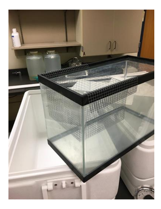
Figure 2. Image showing galvanized mesh egg basket.

individual aquarium and cooler were filled with 19 and 57 L of water, respectively, for a total of 114 L of water per system. Pre-soaked baskets built with galvanized hardware cloth (Galvanized Steel Hardware Cloth, 6.35 mm square mesh, Blue Hawk, Lowe's) were used to support egg masses to help ensure adequate circulation (Figure 2). Treatment water for each hardness level was aerated, heated, and filtered in a cooler then pumped through a manifold into three individual aquariums to circulate (Figure 1). We used one heater (ViaAqua 300-Watt Quartz Glass Submersible Heater), filter (Fluval 207 Performance Canister Filter, Rolf C. Hagen Corp., Mansfield, MA; Top Fin CF60 Canister Filter, United Pet Group, Earth City, Missouri; Marineland Magnum Polishing Internal Canister Filter and Marineland Magniflow 220 Canister Filter, Spectrum Brands Pet, LLC, Blacksburg, VA), and water pump (Ecoplus Eco-396 Submersible Pump, Hawthorne Gardening Company, Vancouver, WA) per cooler. We used one aerator (Sweetwater Model SL56, Aquatic Eco-Systems Inc., Apopka, FL) with a manifold that split to each of the seven coolers for aeration. Total hardness (mg/L), pH, dissolved