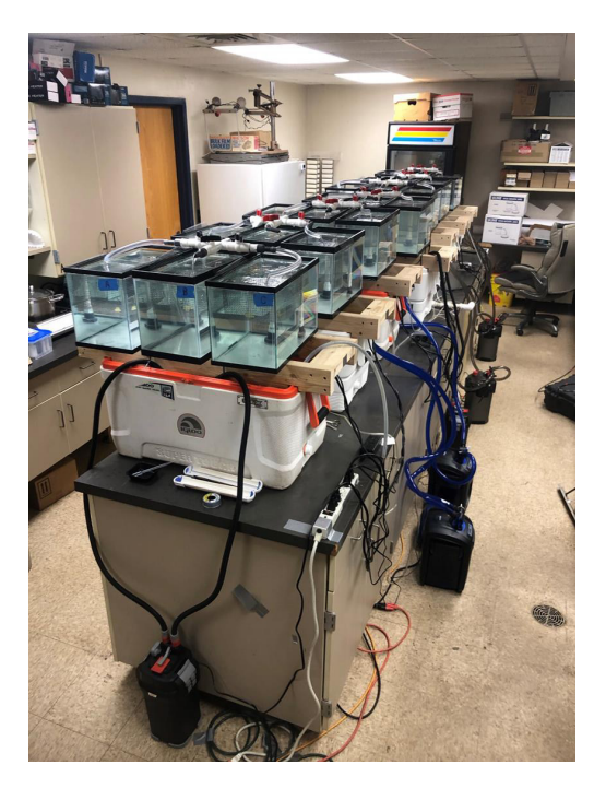
Figure 1. Image of tank setup showing seven treatment levels (cooler/tank complex) and three replicates (A, B, and C).

Twenty-one 19-liter aquariums (Aqueon Standard Glass Aquarium Tank, Aqueon Products, Franklin, WI) were placed on top of seven 68 L coolers (Igloo Marine Ultra 72, Igloo Products Corp., Katy, TX) in three rows of seven (rows A, B, and C; Figure 1). Each