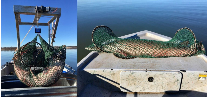
Figure 1. Photographs depicting the winching apparatus used to weigh Alligator Gar and the fish sock (25.4 mm #60 green-twine mesh x 3.05 m long x 457.2 mm diameter) used to support Alligator Gar.

Alligator Gar. Differences between individual weights and lengths predicted from the simple linear and multiple regression equations were tested against actual fish weights and lengths using paired t-tests. Strength of each model was evaluated by comparing percent error [(\text{Observed} - \text{Predicted})/\text{Predicted} \times 100] by averaging the percent predicted error across all observations for each model (Wood 2005, Scharf et al. 1998, Snow et al. 2017, Jeter et al. 2019). Additionally, bias plots were constructed to compare bias between actual and predicted girths, lengths, and weights of Alligator Gar. A bias plot was not constructed for TL:SL, as this relationship was highly correlated ( r^2 = 0.99 ). All statistical analyses were conducted at a significance level of P \leq 0.05 .