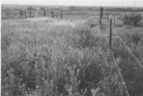
FIGURE 2. Portion of bermudagrass pasture in McClain County, OK, heavily populated with Carthamus lanatus L., distaff thistle, May 22, 1986.

Meadly (8) discusses ecological relationships of Carthamus lanatus . Its dispersal in Australia has been "due, in the main, to the distribution of hay, chaff, and grain containing seeds of the weed", an appraisal also given by the Tasmanian Journal of Agricul-