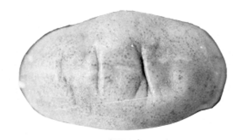
FIGURE 12. Vaginulus occidentalis, dorsal view. Scale = 4.0 mm.