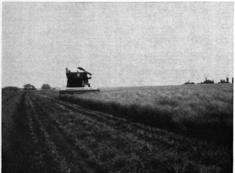
Fig. 6. Harvesting experimental planting of Crambe abyssinica in Texas with conventional grain combine.

Among those revealed by the screening program thus far to have high potential are: kenaf ( Hibiscus cannabinus ) (Fig. 2); sunn hemp ( Crotalaria juncea ) (Fig. 3); sorghum ( Sorghum vulgare ), and sesbania ( Sesbania sp.) These prospective annual pulp crops are now undergoing developmental research in crop production and in pulping tests.