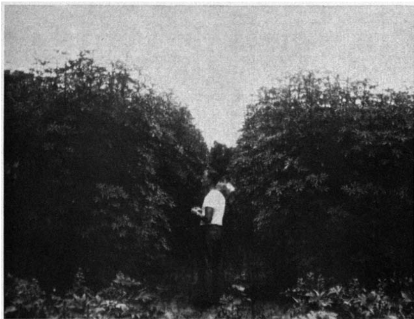
Fig. 2. Kenaf ( Hibiscus cannabinus ) in experimental planting in North Carolina. Yields of 5 tons of dry stalks per acre are not uncommon in test plots.

The development of modern science and technology in the last hundred years has provided man with tools and knowledge to probe much deeper into the complexities of the compositional attributes of his environment than has ever before been possible. This same advance in technological development has produced an ever increasing pressure for new and different raw materials to keep pace with changing industrial needs. Man in his plant screening activities has only begun to take advantage of the new approaches and new objectives borne of the industrial revolution. But a beginning has been made and the results already achieved give us confidence that the possibilities are excellent for finding many new useful properties of plants through the modern chemistry and technology of utilization research. Furthermore, we have every reason to believe that the many recent advances in the plant sciences, both basic and applied, can provide the know-how needed to develop crop sources of usable constituents discovered by utilization research. Mr. Wheeler McMillen of the National Farm Chemurgic Council puts it in more forceful language, and I quote: "I wish to express my unflagging astonishment at a particular blank area in human progress. It has long since been observed that civilization progresses like an army in conflict not along one broad and event front, but by advancing on one salient, while another stands still and awaits a suitable time to move forward.