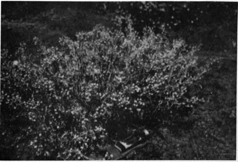
Fig. 9. Yellow-top ( Lesquerella fendleri ). The Lesquerellas are native to southwestern United States and northern Mexico. A number of the species are heavy seeders and all so far examined have unusual seed oils of industrial interest.