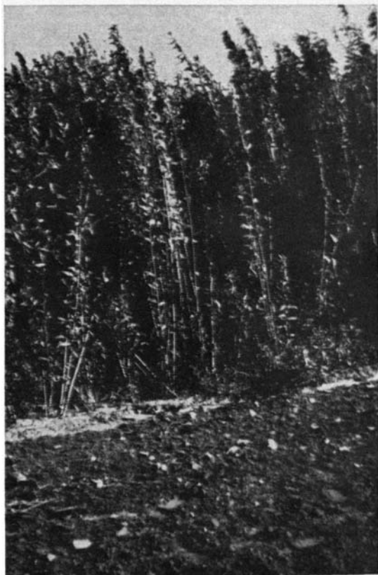
Fig. 3. Sunn hemp ( Crotalaria juncea ) in Kansas. Plants in this experimental plot are about 12 feet tall.

century. We have seen the movies appear on the screen, and begin to talk, and bloom in color and now advance in three dimensions. We heard radio ride the atmospheric waves and now we see the unbelievable miracle of television. Some of us are alive today only because science reached into the soil and trained antibiotic substances to protect our health. We have watched as men ride the air over land and sea and go faster than the speed of sound. We have seen the power of the atom unleashed to commit incredible destruction, and now await its power to be harnessed to create wealth and happiness instead of death.