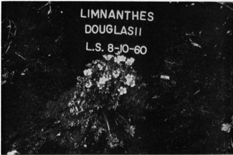
Fig. 8. Meadowfoam ( Limanthes douglasii ). All members of this native North American genus have long-chain fatty acids in their seed oils. Such oils can be chemically converted to waxes.