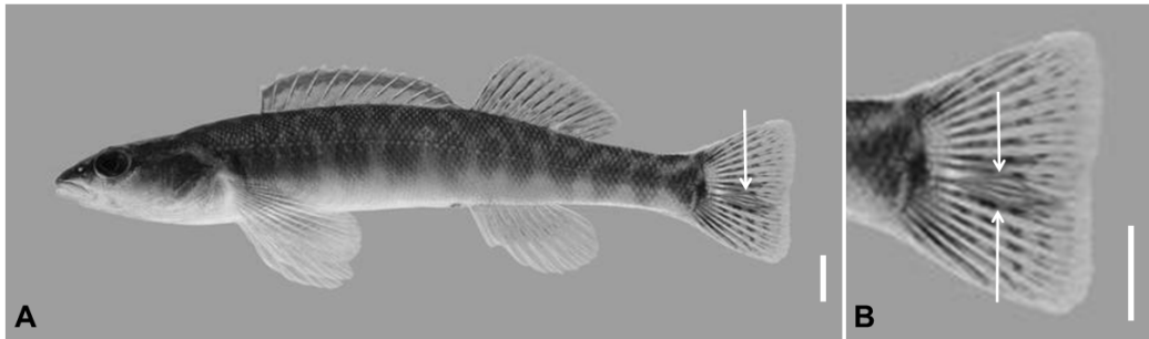
Figures 3A-B. Leech from Percina phoxocephala . A. View of Myzobdella reducta (arrow) on caudal fin; scale bar = 10.0 mm. B. Closeup of same M. reducta (arrows) on caudal fin; scale bar = 10.0 mm.

woodrat. One of two N. floridana collected on 9 August 2018 from the Eastern Oklahoma State College Campus-Wilburton, Latimer County (34° 54' 54.3558"N, 95° 19' 51.9024"W) was found to harbor two murine whipworms, Trichurus muris (HWML 110493) in its cecum (Fig. 4). This species is a gastrointestinal parasite of mice which resides in the cecum and colon. In the life cycle, Trichurus eggs are unembryonated when passed in the host feces and take up to a month in a humid environment to become infective and require no intermediate host (Anderson 2000). The hosts obtain the infection by ingesting food items or drinking water contaminated with embryonated eggs. This whipworm has been reported from N. floridana osagensis from Oklahoma (Murphy 1952; Boren et al. 1993). Another species, T. neotomae Chandler has been reported from the southern plains woodrat, N. micropus ,