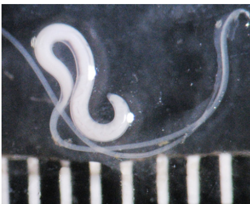
Figure 4. Trichurus muris from Neotoma floridana . Scale bar = 1.0 mm intervals.