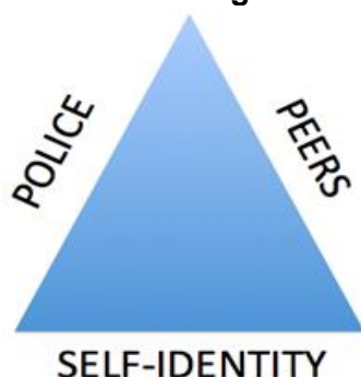
Illustration 1: The Gang Membership Identification Triangle