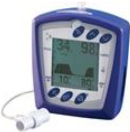
Figure 1. Capnograph device.