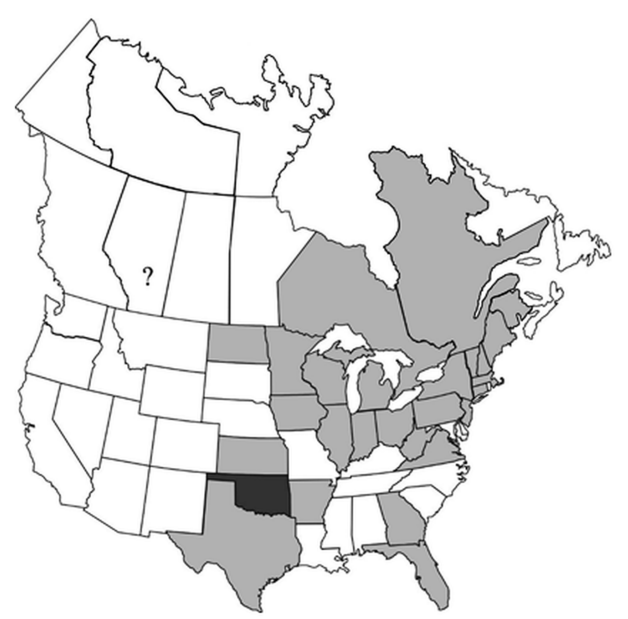
Figure 1. Distribution of Collaria oculata in North America north of Mexico. Light shade = prior literature records (Henry and Wheeler 1988; Maw et al. 2000; Chordas et al. 2011); dark shade = new state record.

During August 2016, various hemipterans were observed by CTM below a night light at a residence in Hochatown, McCurtain County. Specimens were collected with fine forceps and placed in individual vials containing 70% (v/v) ethanol. They were subsequently shipped to